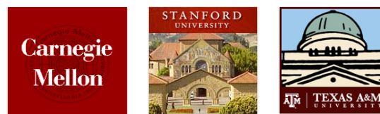
Fig. 4 External iTunes U Sites

Once the classroom presentations and lectures have been uploaded and published, students can download them from iTunes. Then they can transfer them to iPod or iPhone and take it all with them. And suddenly, any place- a café, a bus stop or a Sky train in Bangkok can be a place to learn. To ensure compatibility, the media provided should be in: AAC, MP3, MPEG-4, or PDF format.