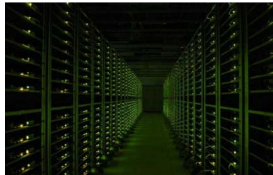
Fig. 2 New Mode of Storage

individually owned devices to the network or the cloud. Much of the newly created knowledge is now residing in the internet infrastructure. Google applications along with other repositories such as Hotmail, Facebook, You Tube and SecondLife allows user to create and store huge amounts of content in the cloud.