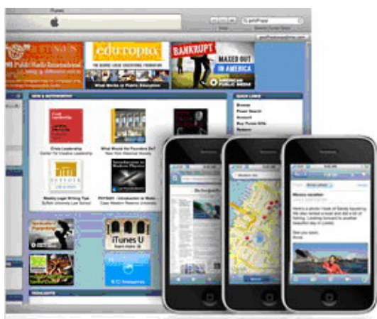
Fig. 3 iTunes University

From portable computers and mobile devices to software and servers to iTunes U, Apple makes all the technology for mobile learning a reality for the students all over the world. Instructors are using iLife and iWork applications on the Mac to create customized educational materials, such as language lessons that students can listen to on the bus or at home.