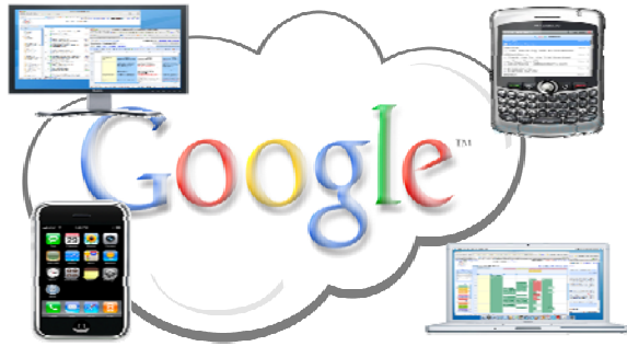
Fig. 1 Cloud Computing

i. Production of new content- In recent years there has been a tremendous shift in the ways new knowledge is produced. Democratized tools of production have given birth to millions of personal blogs and web sites. It has also enabled global collaboration to create new content on sites such as Wikis and social networking services like Facebook, MySpace and SecondLife.