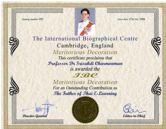
Figure 17. Father of Thai eLearning.

Biographical Centre, Cambridge, UK, as shown in figure 17.