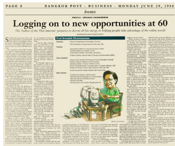
Figure 16. Bangkok Post named Prof. Srisakdi “Father of Thai Internet”.

Prof. Srisakdi has been named "Father of the Thai Internet" by a number of newspapers and magazines such as Bangkok Post, Smart Job, GM Magazine, and Image. Details can be found at <www.charm.Au.edu>, as shown in Figure 16.