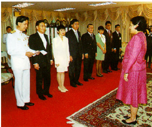
Figure 7. HRH Princess Maha Chakri Sirindhorn granted an audience for Au to present Internet Connection to her.