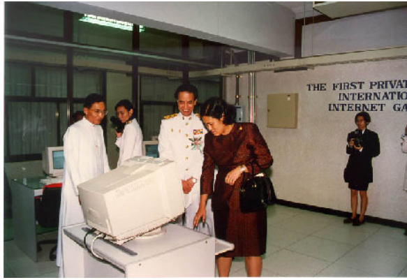
Figure 6. HRH Princess Maha Chakri Sirindhorn graciously pushed the button to start the Gateway.