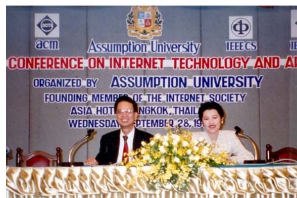
Figure 1. The Co-founders of Internet KSC

The Ministry of Commerce of Thailand approved the registration of Internet KSC or Internet Knowledge Service Center Co., Ltd. on June 7, 1994 with the purposes of providing telecommunications services including Internet. Thus, Internet KSC is the first Provider of Internet Services legally registered in Thailand. All the other fifteen ISPs in Thailand were registered in Thailand months or years after Internet KSC.